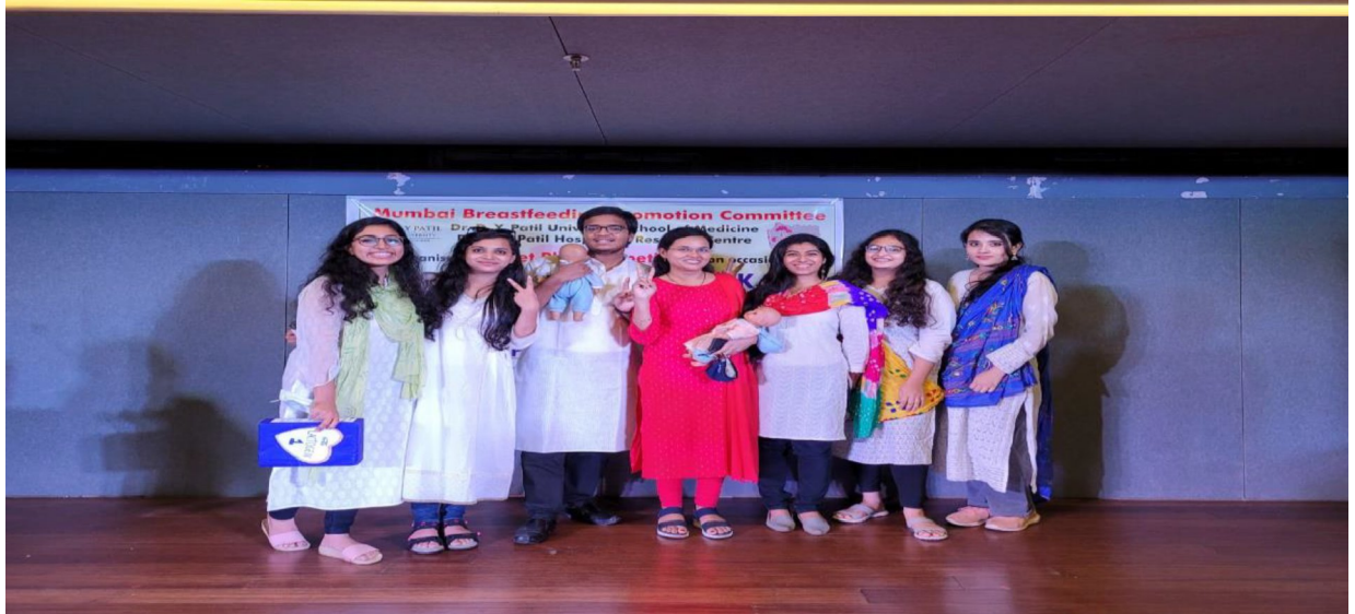
2 nd August 2021,Monday Venue: Terna Medical College, Nerul. POSTER exhibition