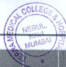
List of Students MBBS for the year 2021-2022